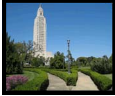
Baton Rouge LA (800) 960-4057

Call or Click Your Gresham Office or contact Marketing for assistance (800) 241-5677