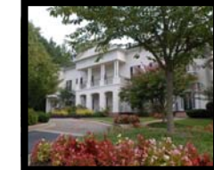
Stockbridge GA (800) 241-5677