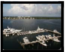
West Palm Beach FL (800) 345-2709